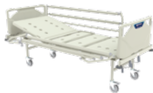
Side-rail position when lowered.