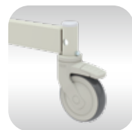
Caster with Individual Locking System Type