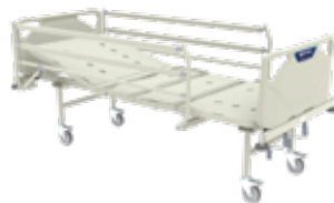
Side-rail position when raised.