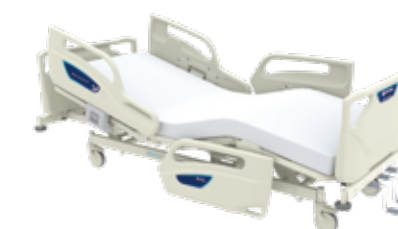
A5 series Manual Bed